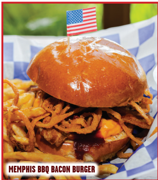
MEMPHIS BBQ BACON BURGER

Extra Sauce/Dressing Sm - 59¢ / LG - 89¢