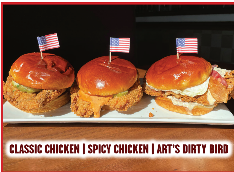
CLASSIC CHICKEN | SPICY CHICKEN | ART'S DIRTY BIRD

All Sandwiches & Burgers are served with fries and cooked to medium unless otherwise requested and may be substituted with the following: Chicken Breast (1.29) / / Turkey Burger (1.79) / / Beyond Meat Burger (2.99) Side substitutions may be made for 1.29+ / / Add more New York Patties (1.99 each) Add an egg (1.29) / / Extra Sauce Sm - 59¢ / LG - 89¢